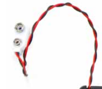
Figure 3 D

The JumpBox uses a high performance regulator circuit to continuously adjust power output depending upon the load requirements of the lock. Traditional batteries and A/C power supplies will experience a drop in voltage as the load on them increases. To use a plumbing analogy, voltage is comparable to the pressure of water circulating in a system of pipes. Any time you tap into the system and pull water out, you'll experience some drop in overall pressure. This effect is the same when a load is introduced to an electrical circuit - the supply voltage decrease can be substantial (sometimes as much as 4.5 volt drop on a 9-volt battery). The JumpBox regulator circuit senses the increase in load and increases the flow of electrical current to maintain constant voltage output.